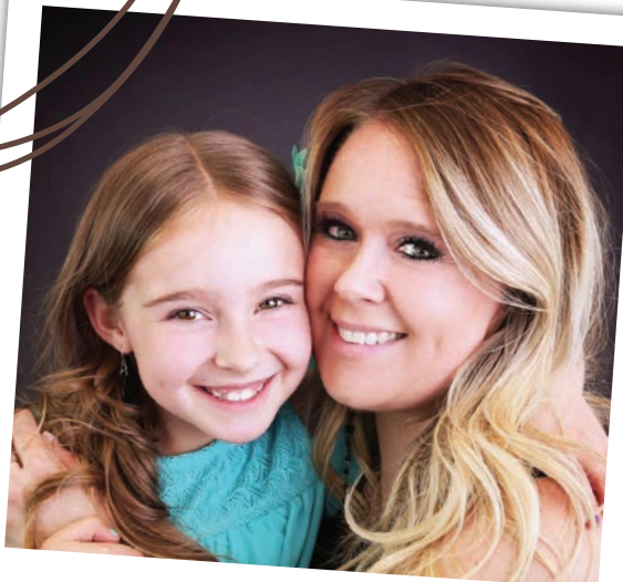
A family tradition